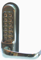
L13654 CL505 SS With Passage Set