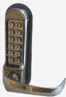
L13127 CL500 SS Without Passage Set